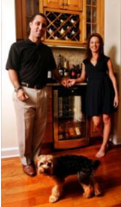
enlarge

Cheval Blanc. He's planning a Napa Valley trip.