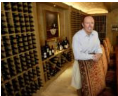
enlarge

Favorite wine vacation: Been thinking about going to California sometime in the near future.